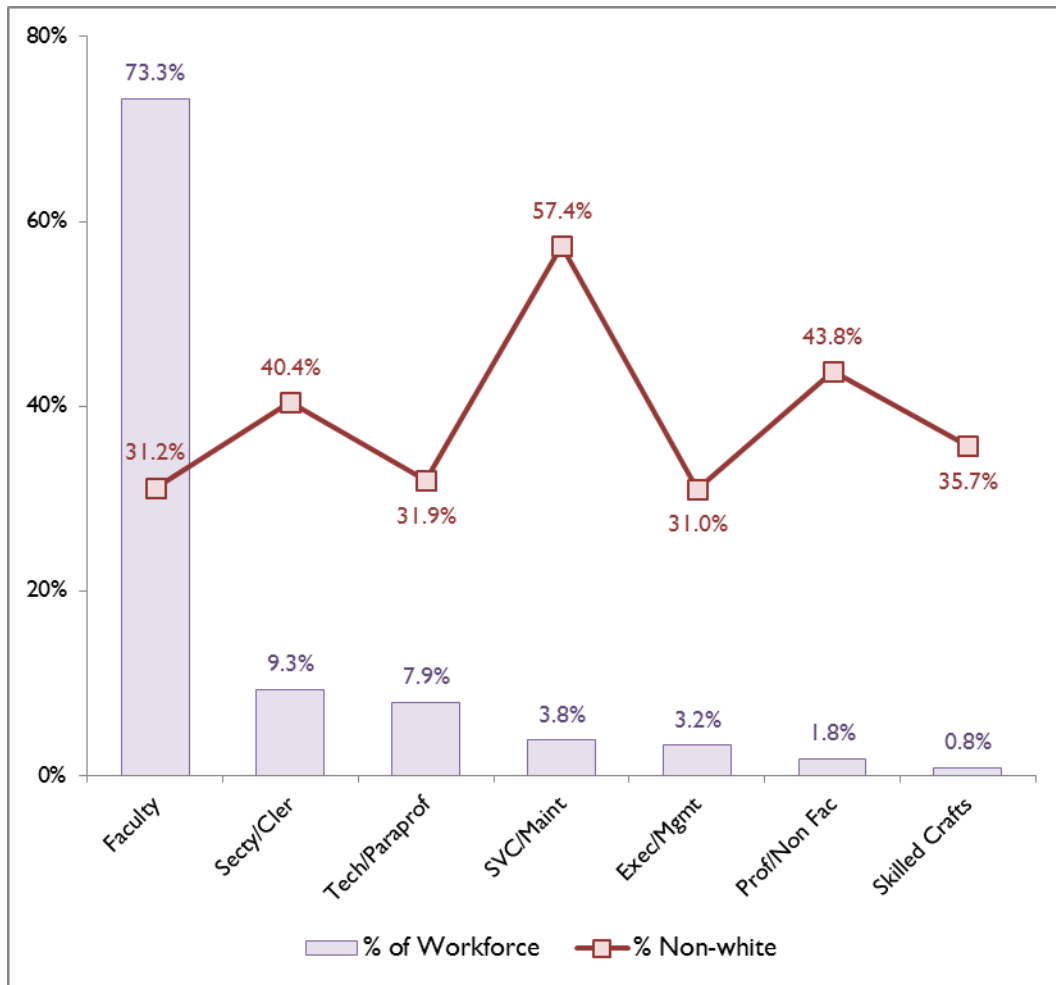
Figure 3: Percentage of Total GCCCD Workforce and Percentage Non-White by Job Category 2016-17